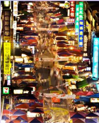
Kaohsiung Leo Ho Night Market