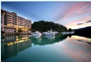
日月潭大滌閣 Del Lago Hotel, Sun Moon Lake

No. 101 Zhongshan Rd. Yu Chi Shiang, Nantou County 555 南投縣魚池鄉日月潭中山路 101 號 +886-49-28555789 http://www.dellago.com.tw/